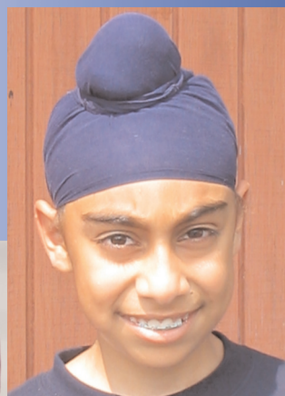
b. Boy with patka