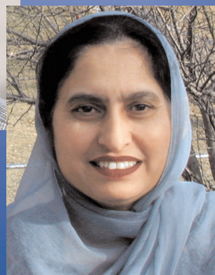
d. Woman with chunni