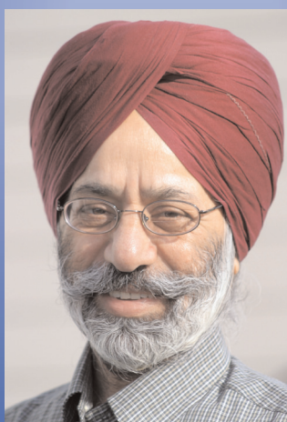
a. Man with pagri